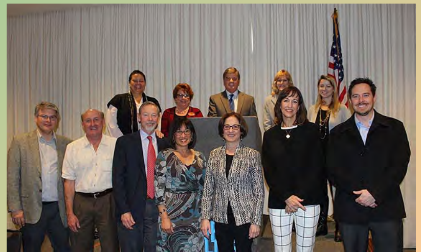
2017 Officers and Directors